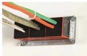
Three (3) devices shown with triple mounting bracket

3M™ Fire Barrier Pass-Through Devices meet the ASTM E 814 (UL 1479) Fire Test Standard and are fire-rated for up to 4 hours (dependent upon system application). 3M™ Fire Barrier Pass-Through Devices use a fixed intumescent material (expands with heat) which works in conjunction with a foam plug and optional mounting brackets. In the event of a fire, intumescent material expands to seal the inside of the device, helping to prevent the spread of smoke and fire into other compartments.